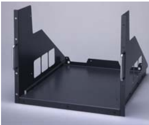
RK-C1900E ■ EIA Rack Mount Adapter

Design and specifications subject to change without notice.